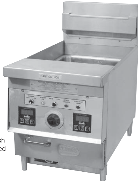
One pair 4 mesh baskets included

The 14 CMTS E Counter Model Fryer is ideal for multi-product use. The 14 CMTS E allows you to cook up to 72 lbs. of frozen french fries or 75 lbs. of chicken per hour with an input of 23.2 kW rated at 240 volts.