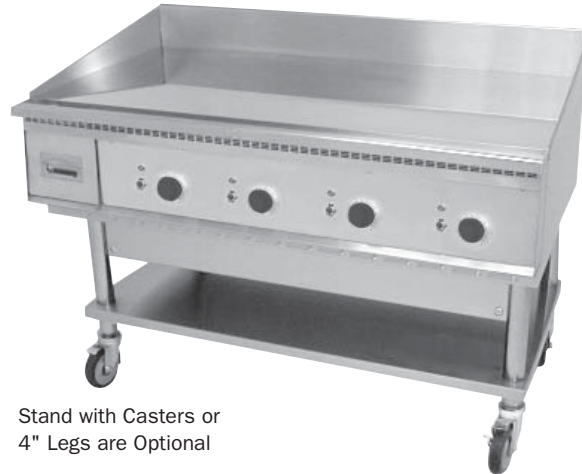
Stand with Casters or 4" Legs are Optional

The Keating MIRACLEAN® Griddle is designed to provide maximum performance with many benefits to the operator. The mirror surface is achieved in a special eight step process. Insulated stainless steel electric elements are mounted every 12" to ensure performance and recovery allowing the operator to use zone cooking for different products.