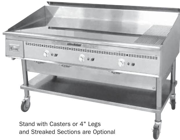
Stand with Casters or 4" Legs and Streaked Sections are Optional

The Keating MIRACLEAN® Griddle is designed to provide maximum performance with many benefits to the operator. The mirror surface is achieved in a special eight step process. High input burners rated at 30,000 BTU/hr. for natural gas are mounted every 12" to ensure performance and recovery allowing the operator to use zone cooking for different products.