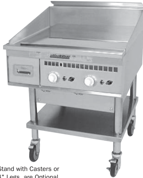
Stand with Casters or 4" Legs are Optional

The Keating MIRACLEAN® Griddle is designed to provide maximum performance with many benefits to the operator. The mirror surface is achieved in a special eight step process. High input burners rated at 30,000 BTU/hr. for natural gas are mounted every 12" to ensure performance and recovery allowing the operator to use zone cooking for different products.