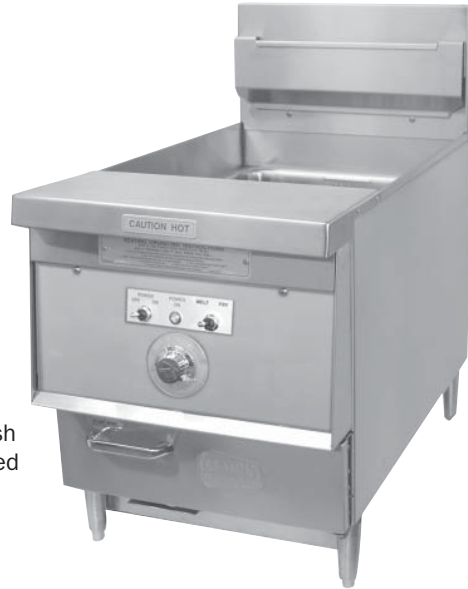
One pair 4 mesh baskets included

The 14 BB Counter Model Fryer is ideal for multi-product use. The 14 BB allows you to cook up to 72 lbs. of frozen french fries per hour with an input of 15.5 kW rated at 240 volts.