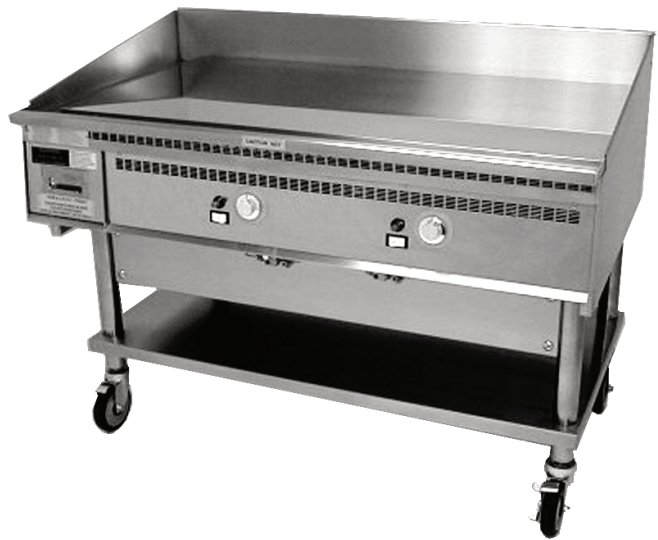
*Stand with casters or 4" legs are optional

The Keating MIRACLEAN® Griddle is designed to provide maximum performance with many benefits to the operator. The mirror surface of the MIRACLEAN® is achieved in a special eight step process. High input burners rated at 30,000 BTU/hr. for natural gas are mounted every 12" to ensure performance and recovery allowing the operator to use zone cooking for different products.