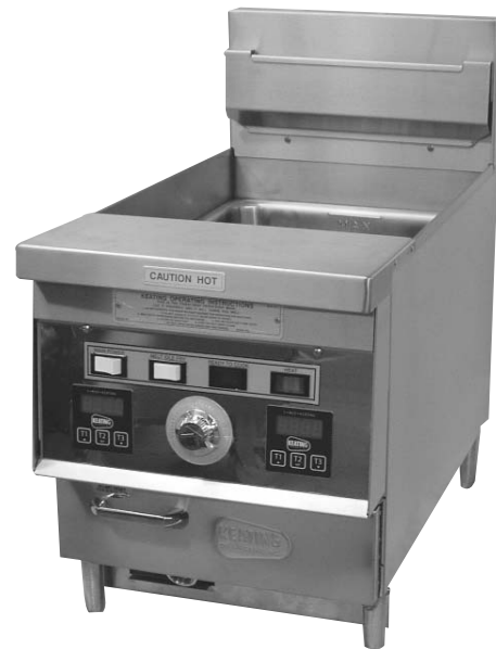
One pair 4 mesh baskets included