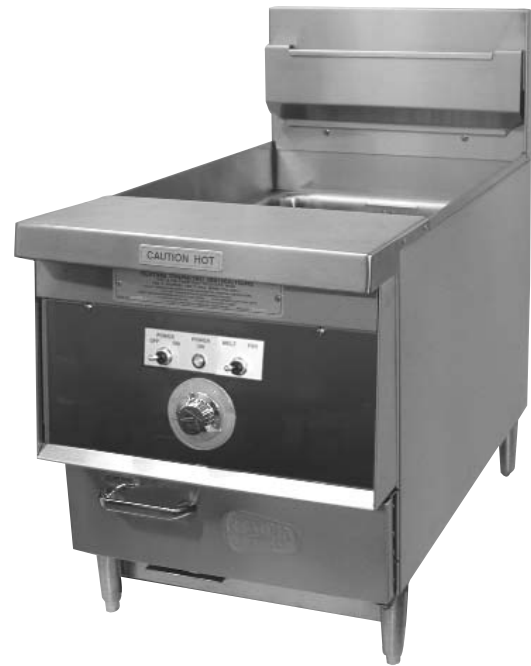
One pair 4 mesh baskets included